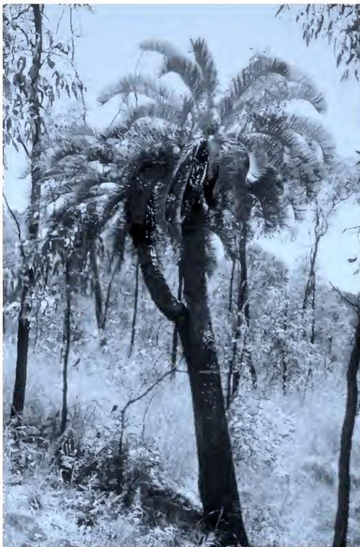
Fig. 3. Cycas cupida habit of large plant.

Distribution and habitat: Cycas cupida is restricted to the Terrace Range, south of Charters Towers. The Terrace Range is an isolated low-lying sandstone range with occasional low outcrops and cliff lines of exposed sandstone rock. The vegetation (Fig. 6) comprises an open woodland dominated by Corymbia clarksoniana , C. dallachiana and Eucalyptus crebra with a midstorey of Acacia bidwillii , A. salicina , Eremophila mitchellii , Lysiphyllum hookeri , Planchonia careya and Terminalia oblongata . The cycads are widely spread in this habitat, being most abundant on the low hills, but can also be found concentrated in gullies and creek lines where they may occur